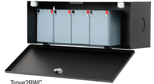
Trove2BWC with batteries